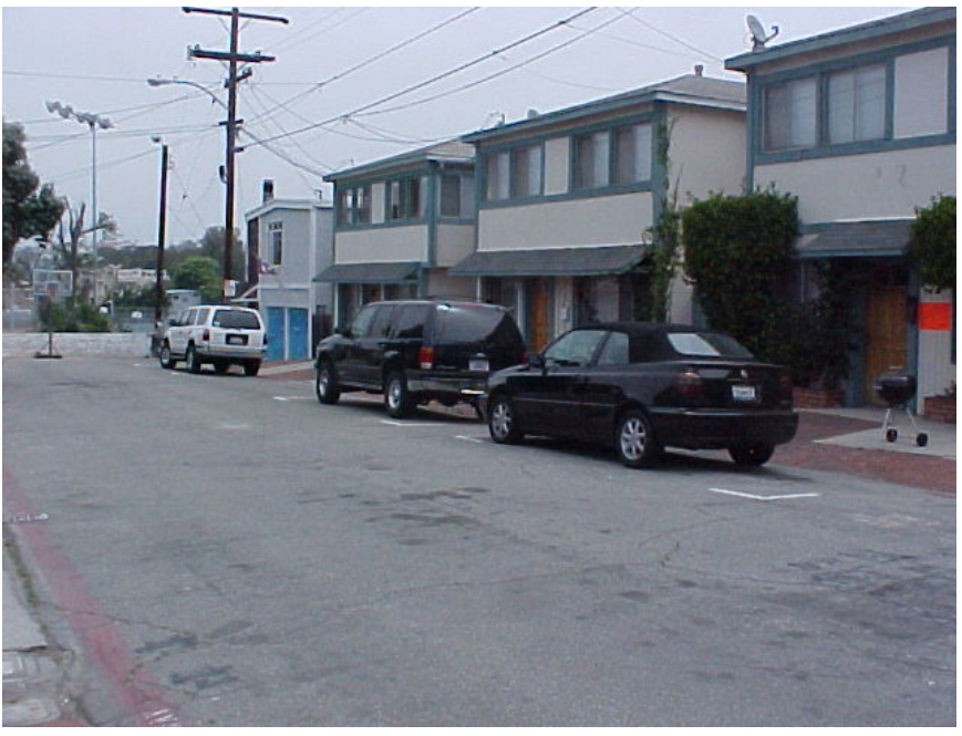
Three on-street parking spaces