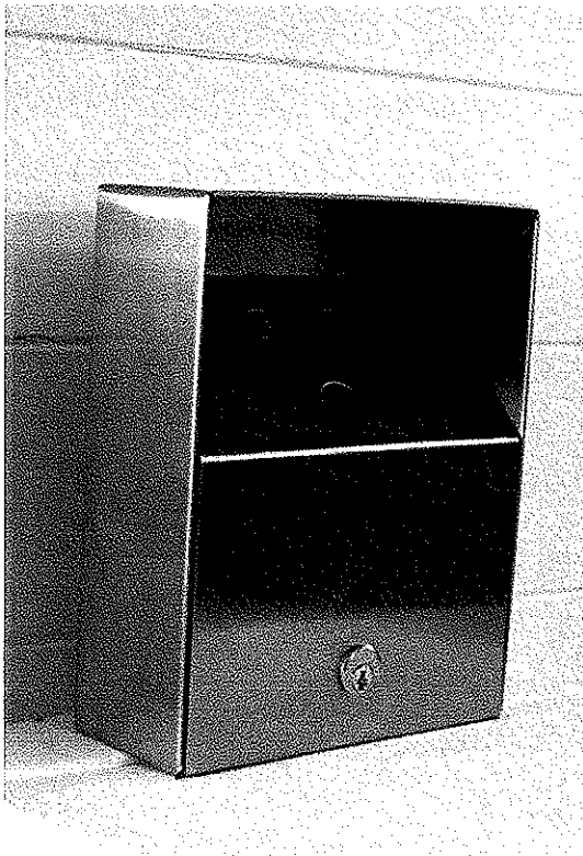
Figure 1: Two view of the cigarette butt receptacles.

Each unit costs about $70 and features a locking mechanism. We have purchased 6 units for the test phase. If successful, we plan to order another 60 units to be placed in various locations around the city, located in areas where they will provide the most benefit in reducing the amount of cigarette butt litter.