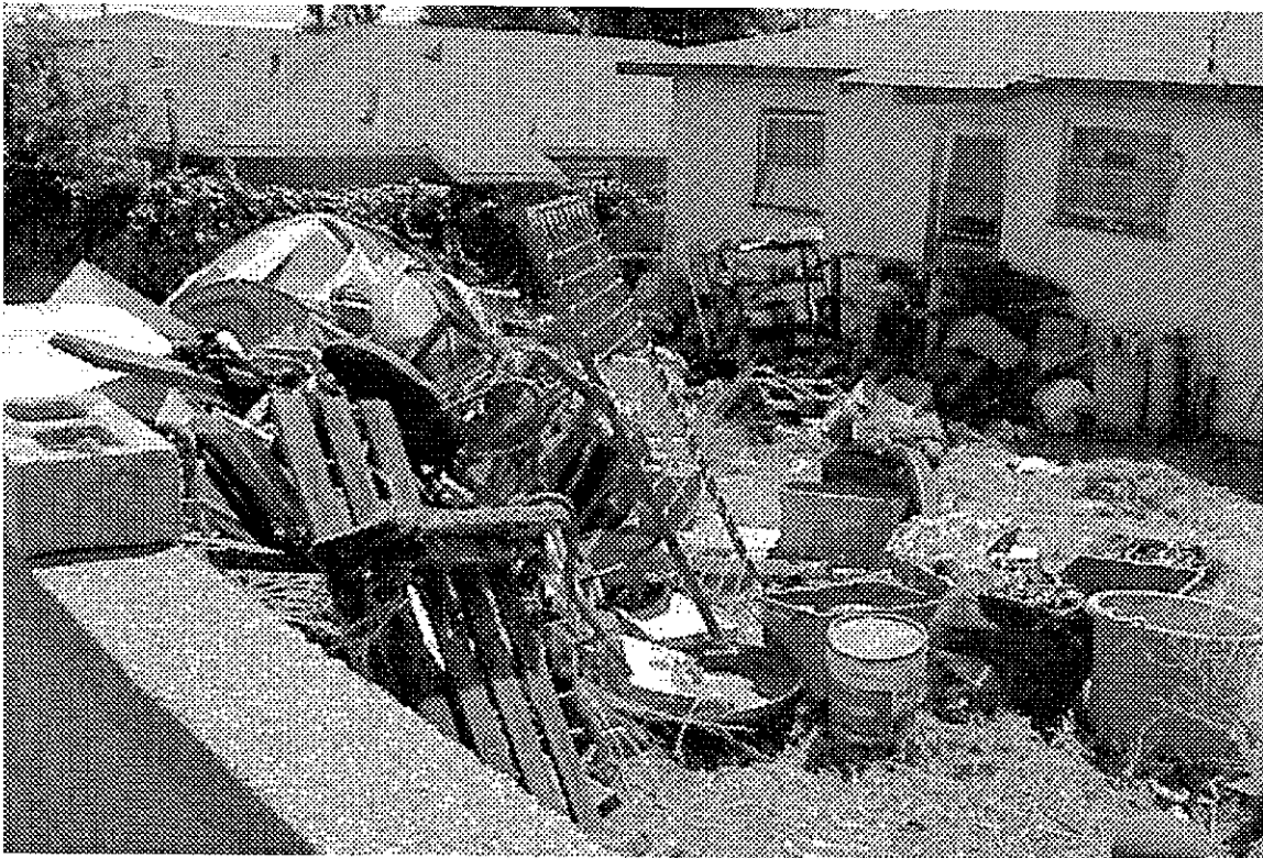
Rear yard of 1928 Ardmore Avenue, August 14, 2006.

The City has received complaints regarding the condition of a house at 1928 Ardmore Avenue. In response to complaints by neighbors, the City has repeatedly inspected the house from the public right of way. The picture below was taken in August of this year. Communication with the resident has not produced any results and these conditions remain. On November 28, 2006, staff has scheduled the initial abatement hearing at City Council.